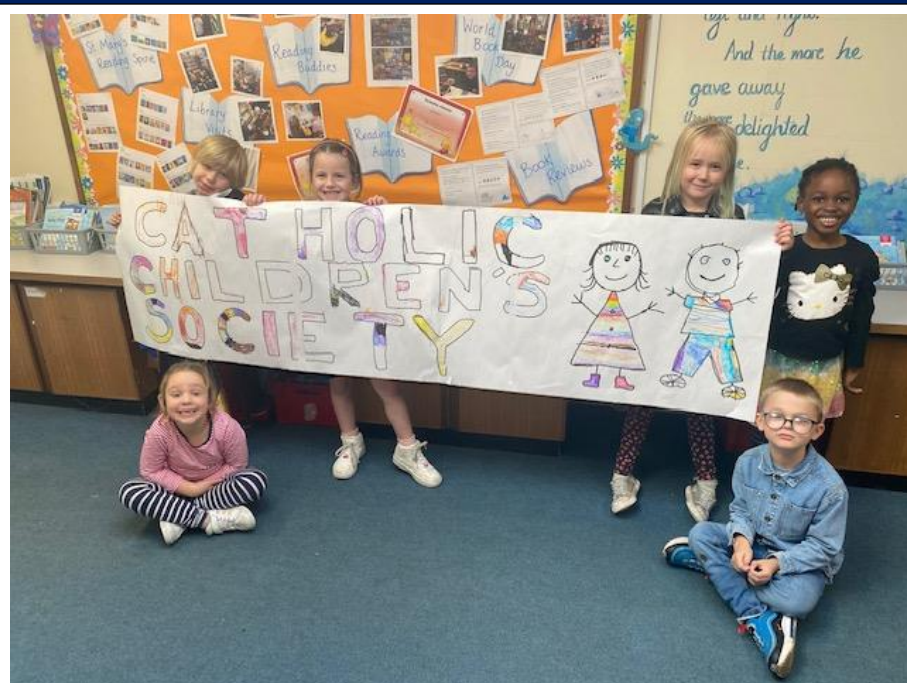
St Mary's Penzance held a non-uniform day!