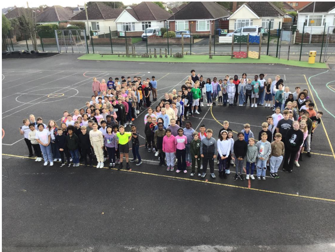
St. Joseph's, Poole raised over £200 for the Catholic Children's Charity on the day. The children in Upper school made a 'human 10' in the playground whilst those in Lower school made number '10' posters, collected and counted '10' leaves and even watched the '10' episode of Numberblocks. We all had great fun!

At Priory Torquay the children began the day with Celebration Assembly followed by MASS where Plymouth CAST were prayed for in church. The children spent time completing crafts and held a party! The children have had a mufti day and have raised £150 so far!