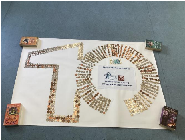
Sacred Heart Paignton

St Mary's Buckfast held Harvest Mass at Buckfast Abbey's Blessed Sacrament Chapel, followed by refreshments for families and friends afterwards. We raised just over £100 for the Catholic Children's Society.